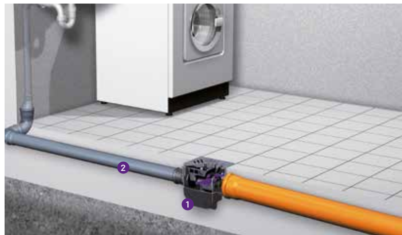
1 Drain 2 Inlet

The Drehfix is a basement drain with integrated, removable backwater valve (Type 5). In addition, it protects connected discharge points such as washbasins, showers or washing machines against wastewater from the sewer. With odour trap, sludge bucket, manually locked emergency closure and a discharge rate of 1.8 l/s, it can be used flexibly and is so compact that it fits in the recesses of old cast iron drains. It is therefore ideally suitable for renovation projects.